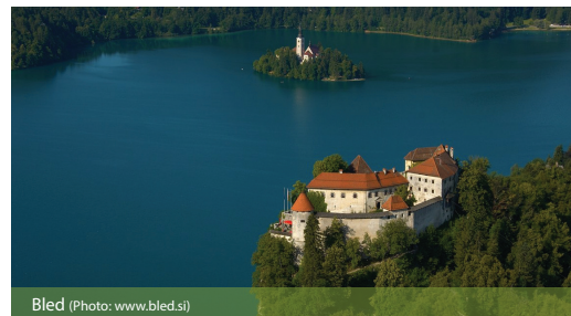
Bled