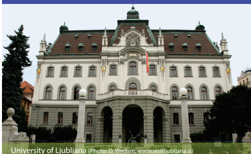
University of Ljubljana